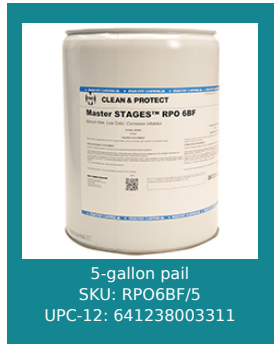
5-gallon pail SKU: RPO6BF/5 UPC-12: 641238003311