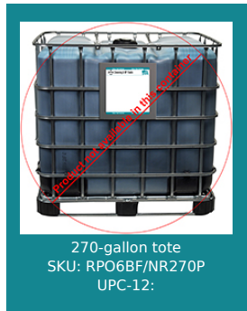
270-gallon tote SKU: RPO6BF/NR270P UPC-12: