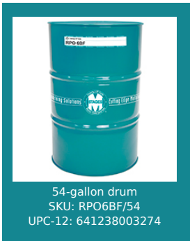
54-gallon drum SKU: RPO6BF/54 UPC-12: 641238003274