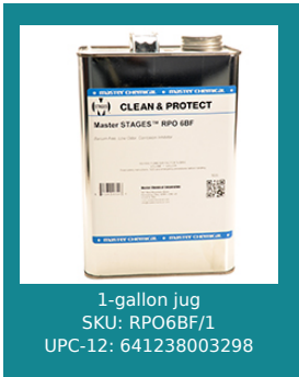
1-gallon jug SKU: RPO6BF/1 UPC-12: 641238003298